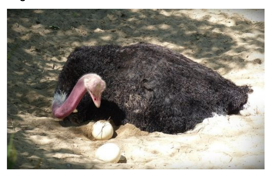
Ostriches lay the biggest bird eggs.

Birds lay eggs. Some eggs are pointy. Some eggs are round. Baby birds grow in the eggs. The babies come out of the eggs when they are big enough.