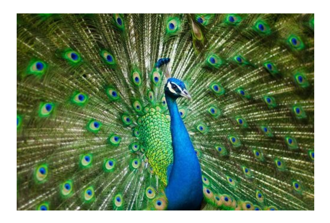
Peacocks have beautiful feathers.

Birds have beaks. Some birds have long beaks. Other birds have short beaks. Birds can use their beaks to help them eat.