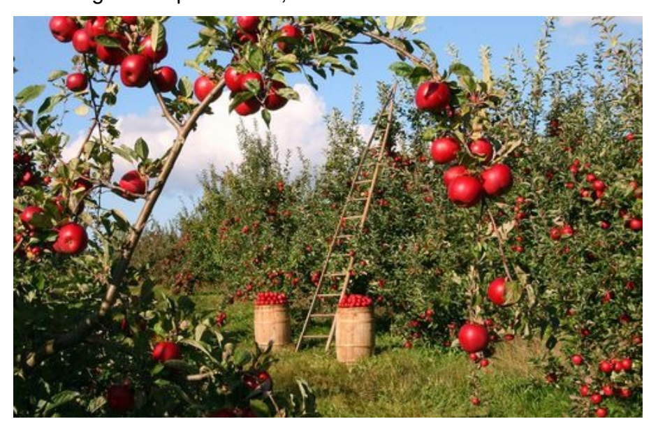
Farmers crow crops like apples.

Farmers grow crops for people to eat. Some insects eat these crops. Some birds eat these insects. This keeps the insects from eating our crops. Thanks, birds!