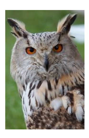
Great horned owls eat other owls.

Owls fly quietly. This helps them catch other animals. The animals can't hear the owls coming. Owls use their claws to grab the animals.