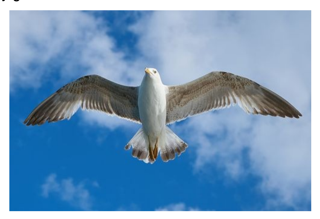
A seagull flies.

Birds have wings. Many birds use their wings to fly. Up, up, and away they go!