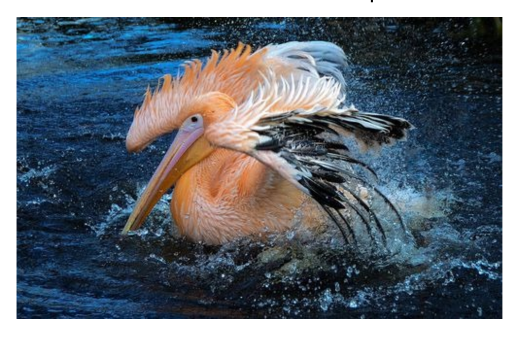
Pelicans have long beaks.

Birds have beaks. Some birds have long beaks. Other birds have short beaks. Birds can use their beaks to help them eat.